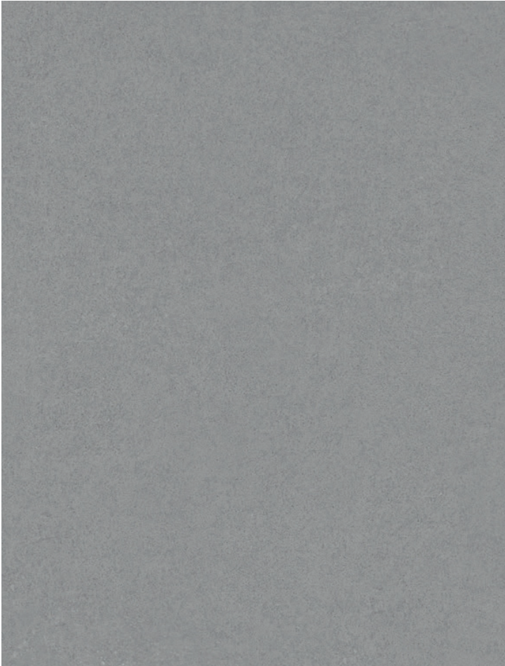
1237 Shade Medium