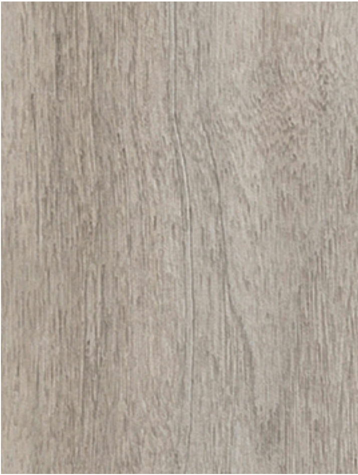
1233 Rhapsody Beige