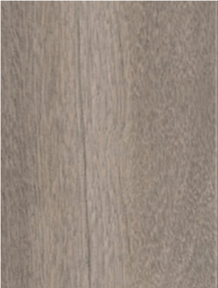
1234 Rhapsody Grey