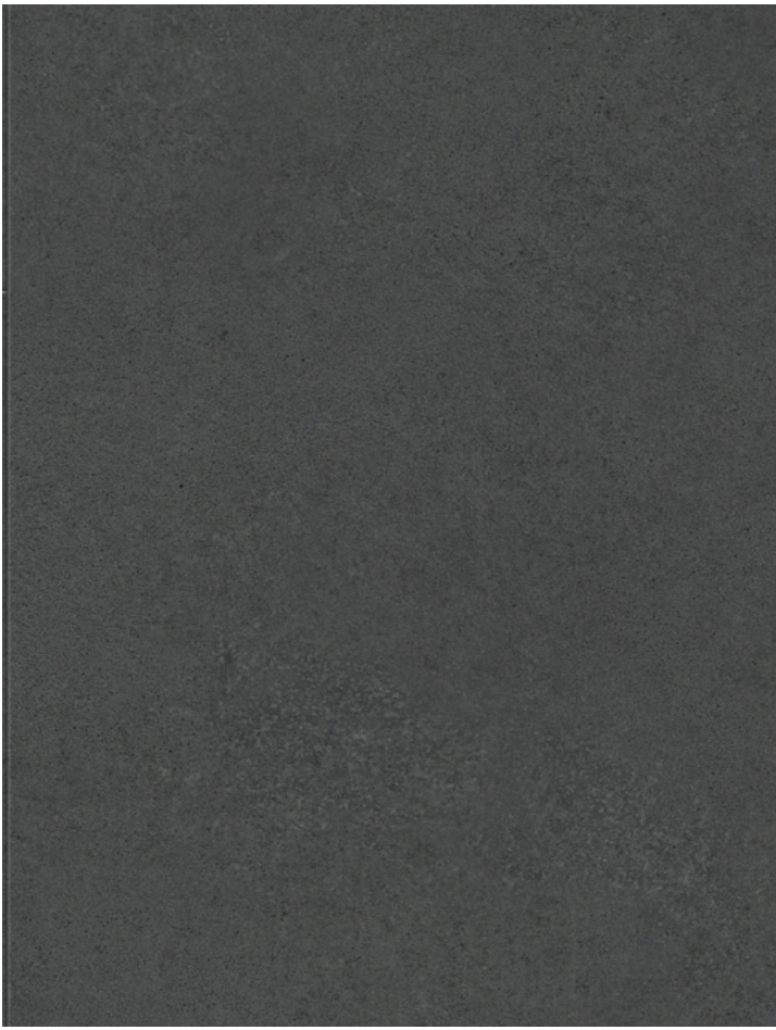
1238 Shade Dark