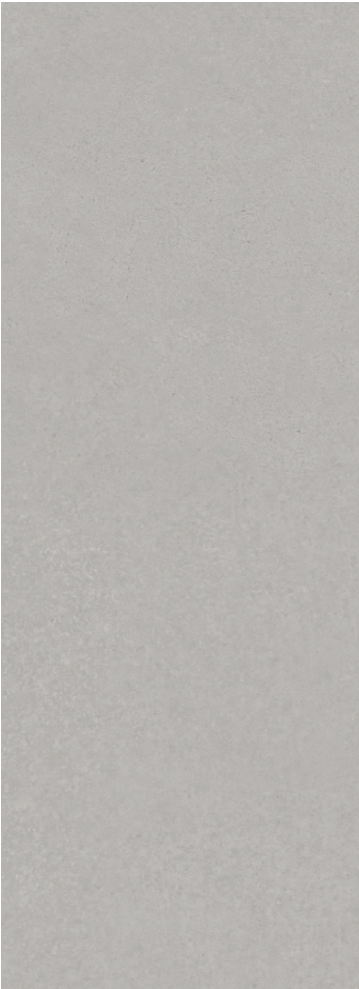
1236 Shade Light