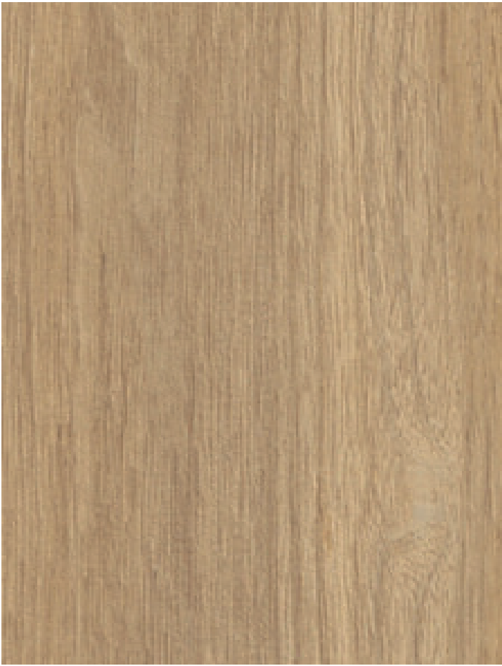
1226 Rhapsody Honey